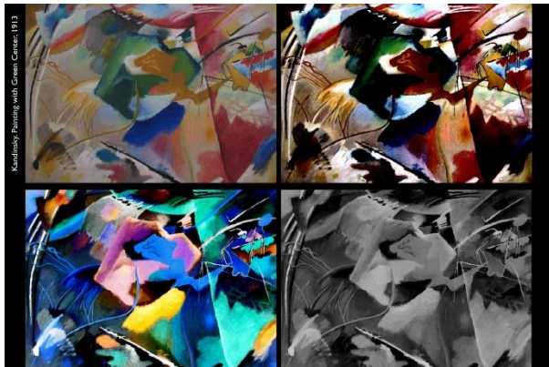
The images show three different visual adjustments of the same image (Original in top left corner - Kandinsky, 1913)

Audiovisual Rorschach: Aimed at exploring how we use sound to make sense of visual information, participants are asked to describe what is seen when presented with abstracts animations accompanied by music with a specific sonority.